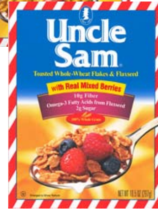
Uncle Sam Cereal $2.49-2.99

Original, Mixed Berries 10-10.5oz [Suggested Retail $3.39-4.19]