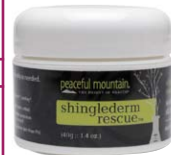
Peaceful Mountain Rescue Formulas $17.99-19.99

Shinglederm, Shinglederm + 1.4oz [Suggested Retail $27.19-29.89]