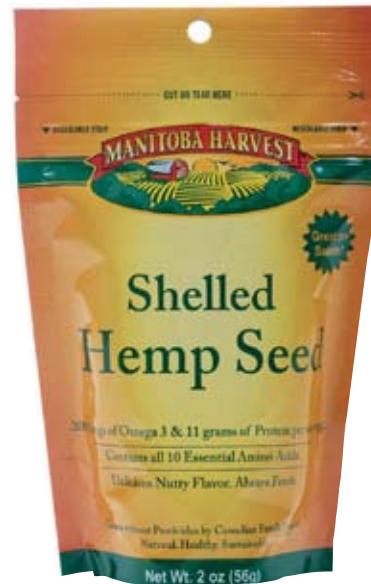
Manitoba Harvest Shelled Hemp Seed $5.99

La Vodka Sauce, Tomato Basil 25oz [Suggested Retail $7.59]