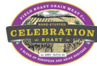
Field Roast Celebration Roast $5.99