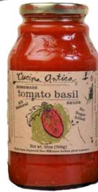
Cucina Antica Sauce $5.79

La Vodka Sauce, Tomato Basil 25oz [Suggested Retail $7.59]