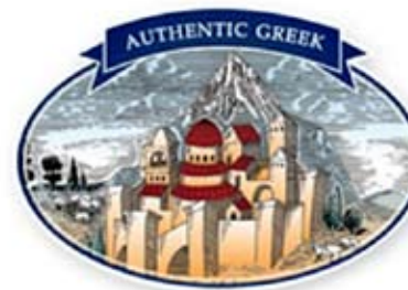
Mt. Vikos Artisan Cheese $4.49