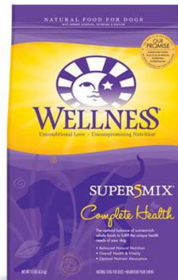
Wellness Dry Super5Mix Dog Food $23.99

Original, Mixed Berries 10-10.5oz [Suggested Retail $3.39-4.19]